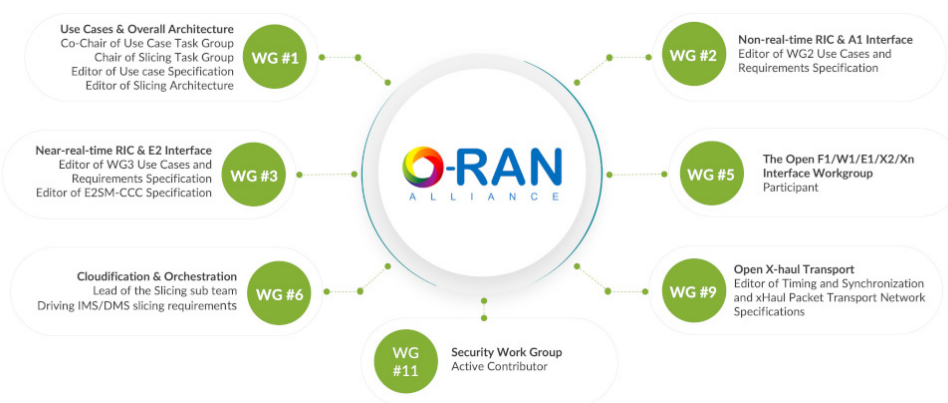
Figure 3: Juniper is championing Open RAN by working closely with ecosystem partners in the industry. Juniper contributes to seven working groups in the O-RAN Alliance and serve as the chair and co-chair of the slicing and use-case task groups

Juniper is an active proponent of Open RAN in several industry and standards organizations. Juniper contributes to 7 of the 11 working groups in the O-RAN Alliance. Juniper chairs the Network Slicing Task Group, co-chairs the Use Case Task Group, and serves as editor and contributor to several specification documents.